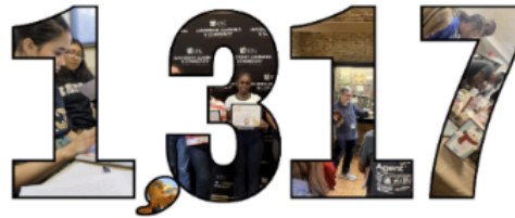
Service-Learning Enrollment in 93 Courses