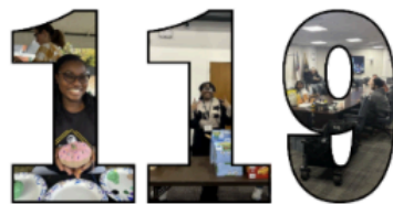
Programs, Events & Volunteer Opportunities